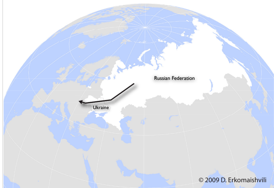
Gas export route to Europe

Neither should political risks associated with the run up to January's presidential elections in Ukraine, and their capacity to precipitate a new gas crisis, be underestimated. Ukraine's president, Victor Yuschenko, opposed the January 19 agreements between Gazprom and Naftogaz, which were signed under the auspices of his prime minister and staunch presidential campaign rival, Yulia Tymoshenko. The rivalry between the two Ukrainian leaders has intensified, and it is not unlikely that Yuschenko, who is running significantly behind Tymoshenko in the polls, would employ the "gas card" in undermining Tymoshenko's campaign. While Tymoshenko and Putin met each other with cordialities in Yalta last month, Yuschenko urged Russian president,