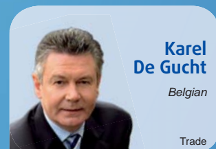
Karel De Gucht

Taxation and Customs Union, Audit and Anti-Fraud